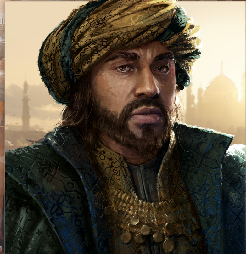
— AL MUTAWAKKIL —