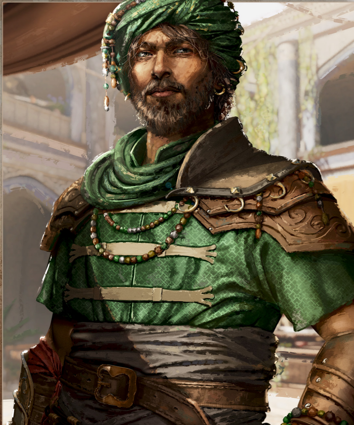
— ALI —