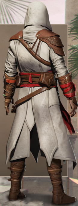
— BASIM MASTER ASSASSIN —